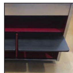
Optional Bagging Shelves