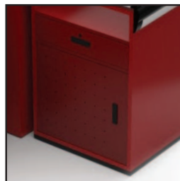
Storage & Drawer