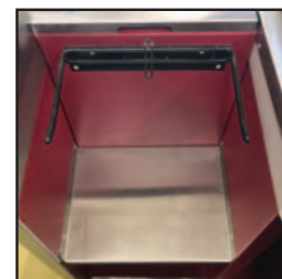
Optional Bag Well