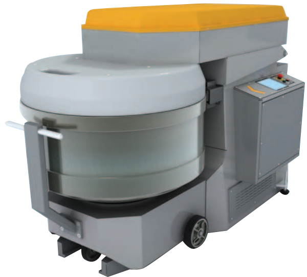
UNISOURCE HEAVY DUTY SPIRAL MUSCLE MIXERS™ SERIES II That's Built to last!