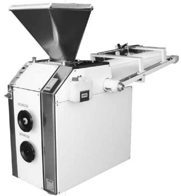
Unisource Compact Divider/Rounder