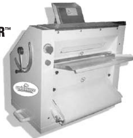
The Unisource Heavy Duty COMPACT BENCH SHEETER™ with 3 Roller, Two Stage Machine for Uniform Dough Sheetting UNI-COMPACT-BDS

EASY ACCESS TO TEFLON STYLE ROLLERS FOR CLEARING OF DOUGH & EASY CLEANING