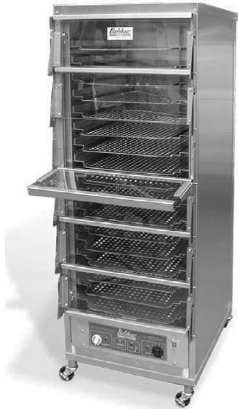
Belshaw Donut Proofer