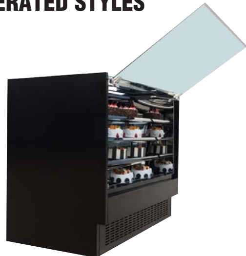
LARGE DISPLAY UNI-Z940W/ UNI-Z940W-NR