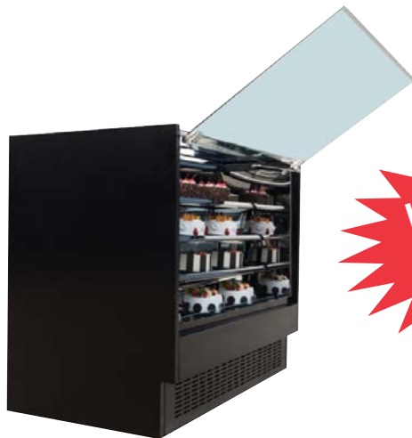
STANDARD DISPLAY UNI-Z940A/ UNI-Z940A-NR