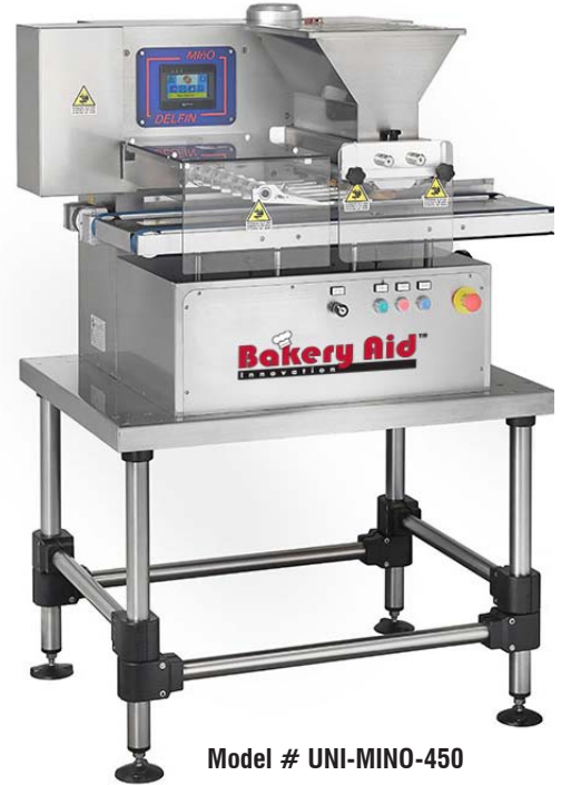
Model # UNI-MINO-450 (Table Not Included)