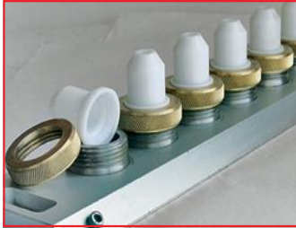
Heavy Duty Nozzles